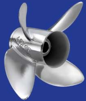
STAINLESS STEEL PROPELLERS